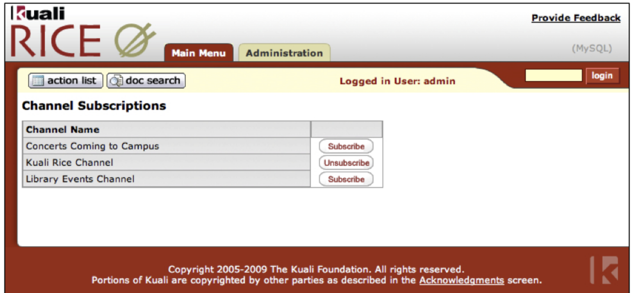
Figure 3.2. Chanel Subscriptions: Manage

Click the Subscribe button for a channel to subscribe to a channel for which you are not already subscribed. Click the Unsubscribe button to cancel your subscription to the channel.